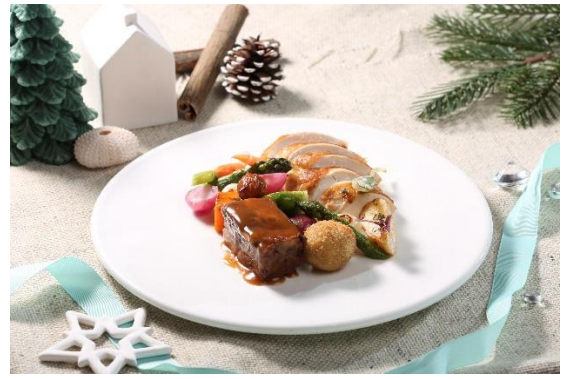
The Boathouse - Festive Menu Roasted Turkey with Slow Braised Beef Short Rib, Sweet Potato Coquette and Root Vegetable ($268)