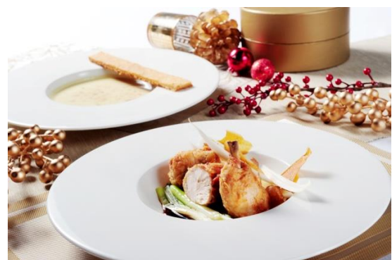
Watermark Christmas Day 4-course dinner $498 per person