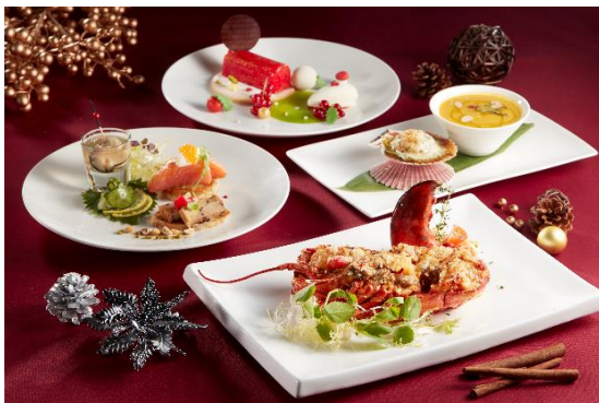
Cafe Deco Christmas Eve 4-course Dinner $788 per person