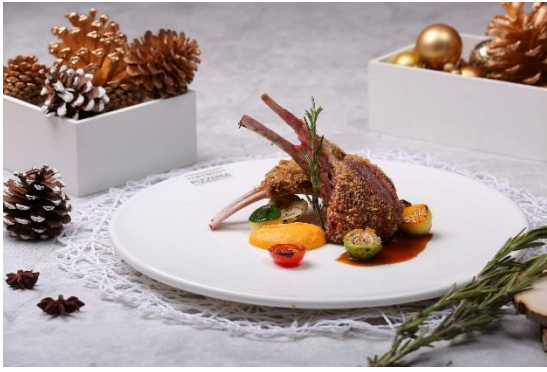
Cafe Deco Pizzeria (Sheung Wan) Christmas Day Semi-buffet Dinner $488 per person