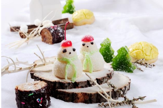
Dim Sum Bar Christmas Dim Sum Quartet $30 per dish