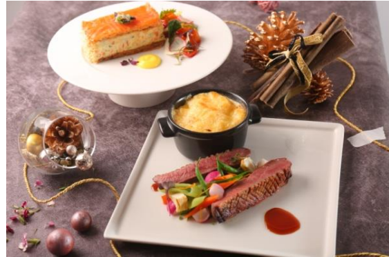
FAUCHON Paris Le Café 3-course Festive Menu $238 per person